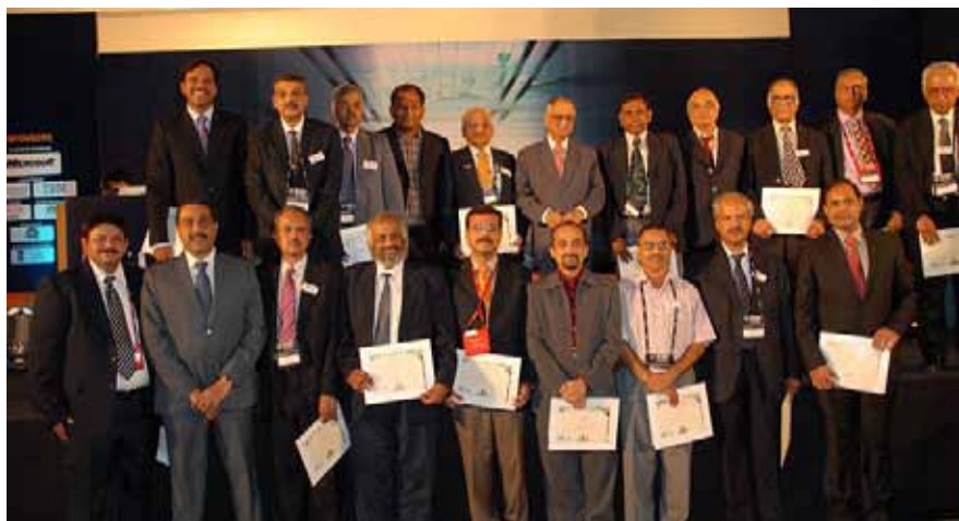
Chapter presidents and board members of PMI Bangalore Chapter with Mr. N.R. Narayana Murthy (center top row).

attracted several policy makers and influencers. The sessions covered challenges of today's e-governance practices, dynamics of project management in e-governance, creating an environment of high-performance project management, and governance and accountability.