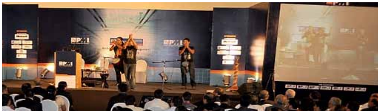
◀ The audience warming up to some drumming with percussionist group, D'frens.

to “not let problems defeat you but instead be the captain of the problems.” A surprise twist to the evening came from a Bangalore percussionist group, D'frens, which had the audience join them in an impromptu jamming session. Delegates turned into instant drummers performing ‘drum circle,’ ‘Mexican wave,’ and ‘causing rain with sound effects.’