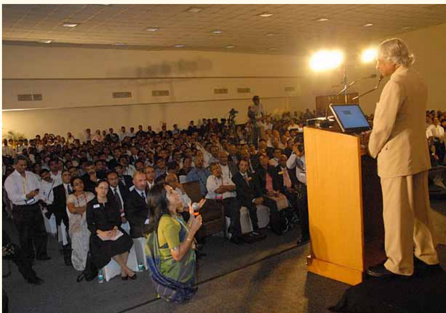
Dr. A.P.J. Abdul Kalam interacting with the conference delegates.