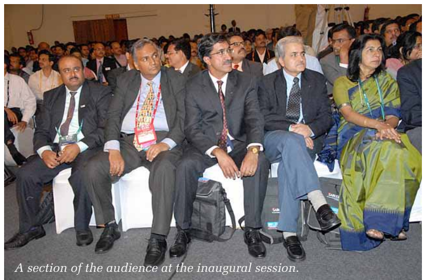
A section of the audience at the inaugural session.

Addressing practitioners at the inaugural session, Dr. Kalam said, “What worked yesterday won’t work today.” He asked project managers