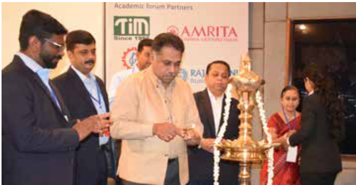
Chapter board members and dignitaries at the inauguration ceremony of Wings 2019.