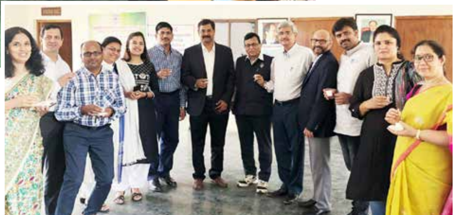
PMIPCC volunteers at the event.

PMI Pearl City Chapter (PMIPCC) in Hyderabad conducted a joint project management advocacy program with Jawaharlal Nehru Technology University (JNTU) at their campus on 5 January. The event, themed “Realizing Objectives with Project Management,” was aimed at helping faculty members and students gain project management skills. Over 60 members of the university’s teaching faculty attended it.