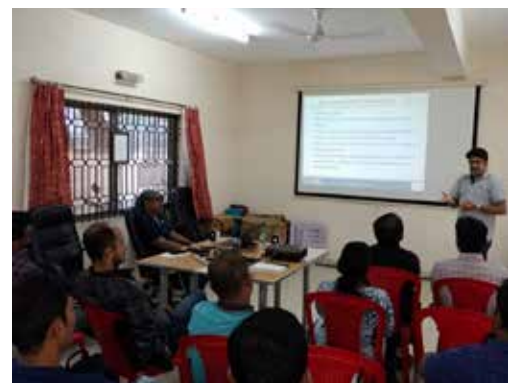
Experts delivering the PMP awareness sessions for chapter members.