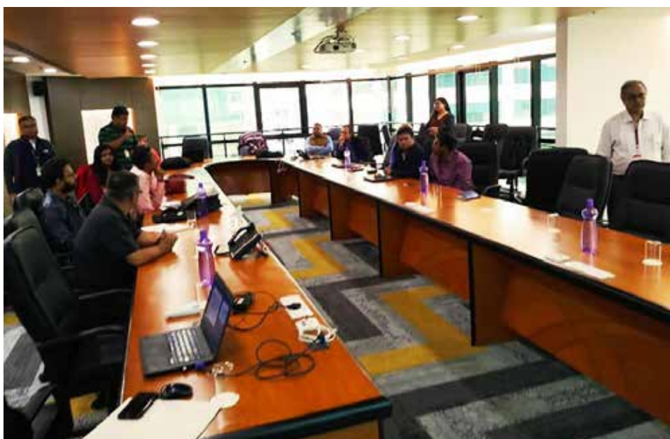
Attendees discussing the chapter's 2019 roadmap at the strategy meet

It started with a discussion on the chapter's activities and successes in 2018. Following that, there was a presentation on the chapter's strategy for each portfolio, initiative, objective, and key deliverable for 2019. By the end of the meeting, well-defined goals and plans for 2019 emerged to take the chapter to the next level.