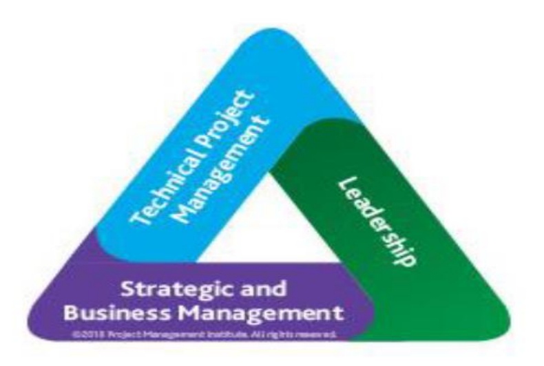
Figure 3/PMI Talent Triangle

Project Management - Powering India's Global Leadership 15-17 September, 2017, Chennai