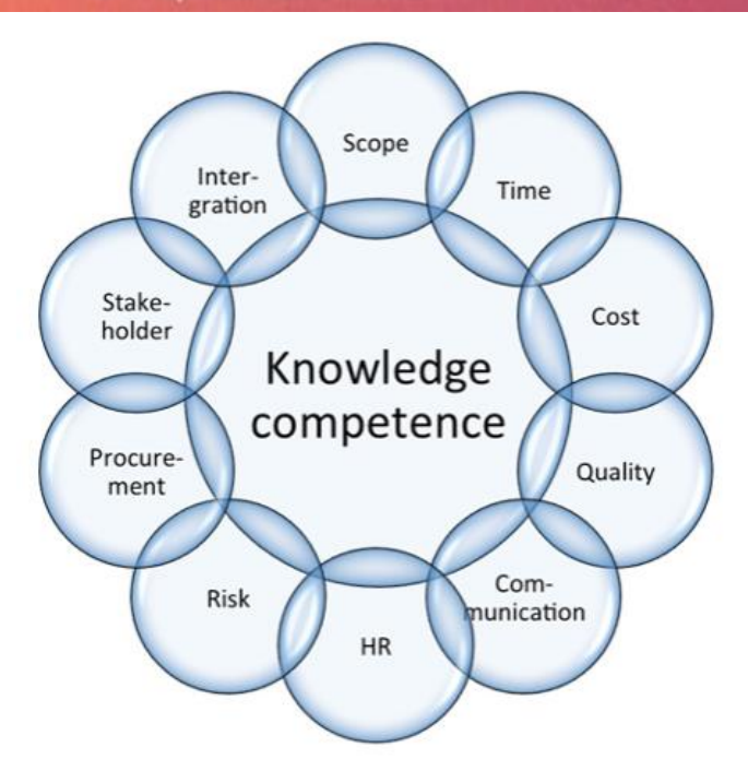
Figure 1PM Knowledge Domains

Project Management - Powering India's Global Leadership 15-17 September, 2017, Chennai