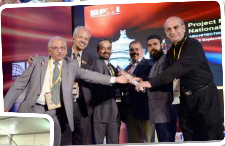
PMI Bangalore India Chapter hands over the baton to PMI Mumbai Chapter and PMI Pune-Deccan India Chapter for the next national conference ▶