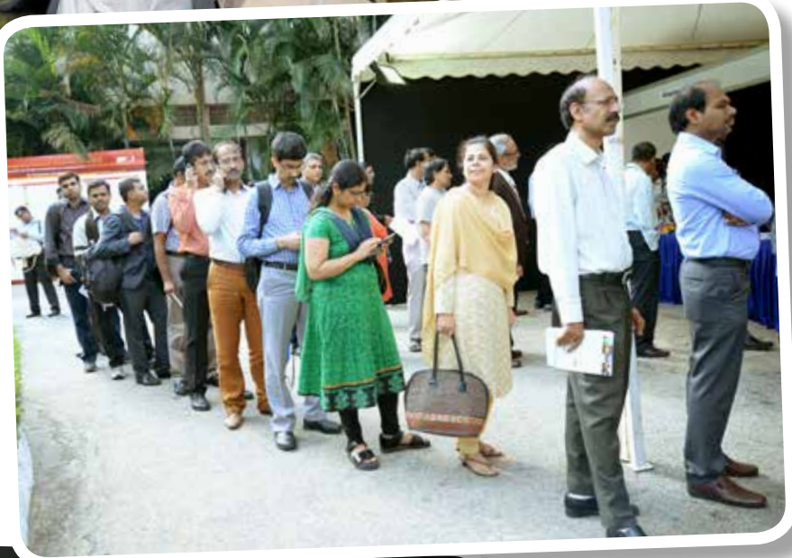
Queues move swiftly at registration desks with many volunteers around to help delegates ▶