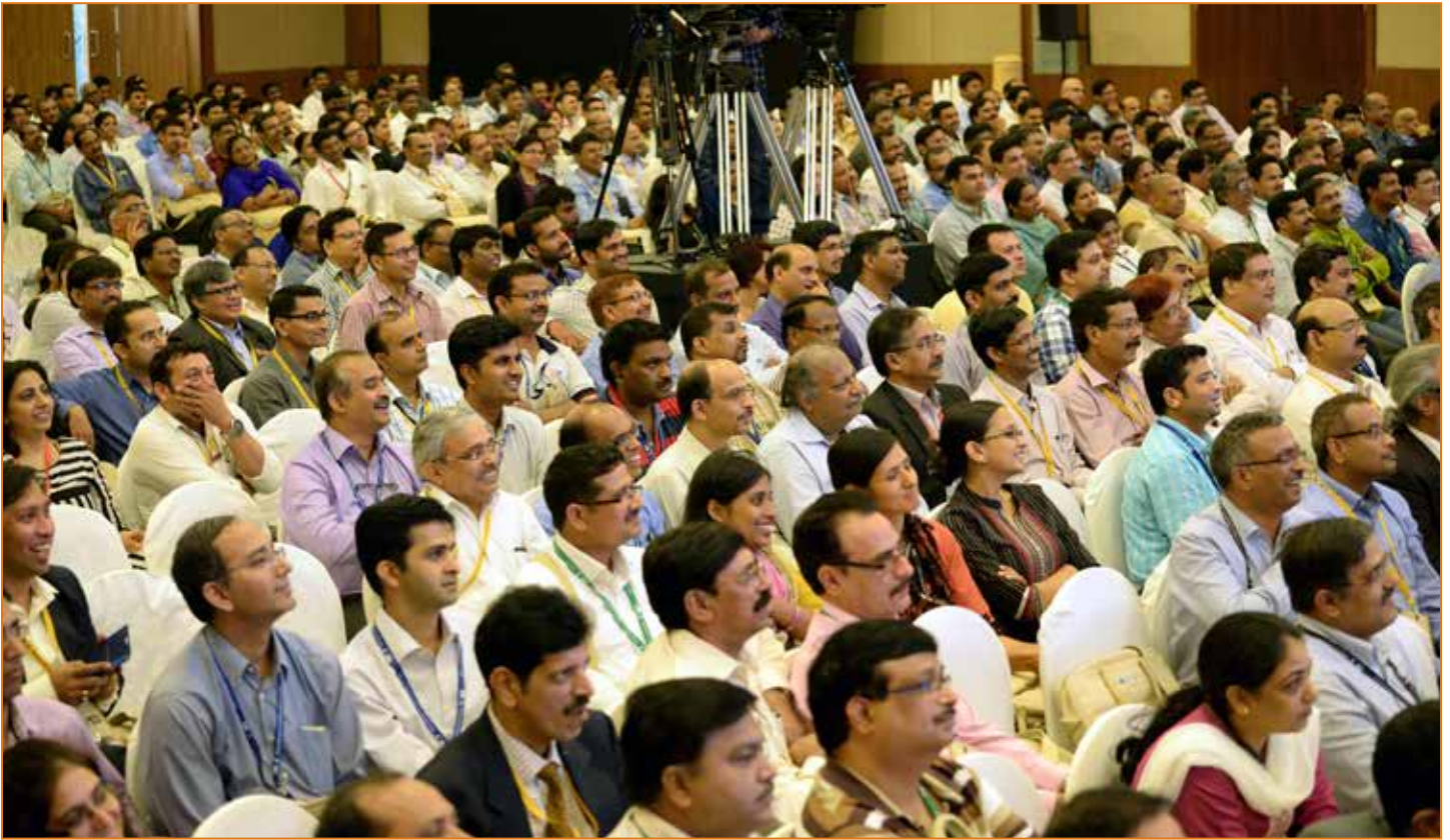
A section of the engrossed audience on the first day of the Project Management National Conference 2015 in Bengaluru