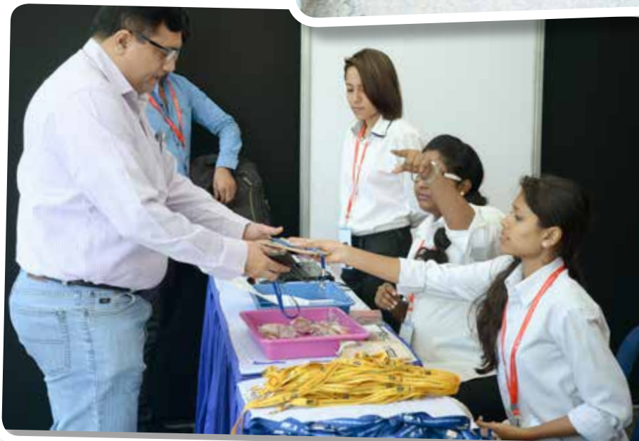
◀ There were more than 10 registration counters to reduce the time taken to complete the formalities