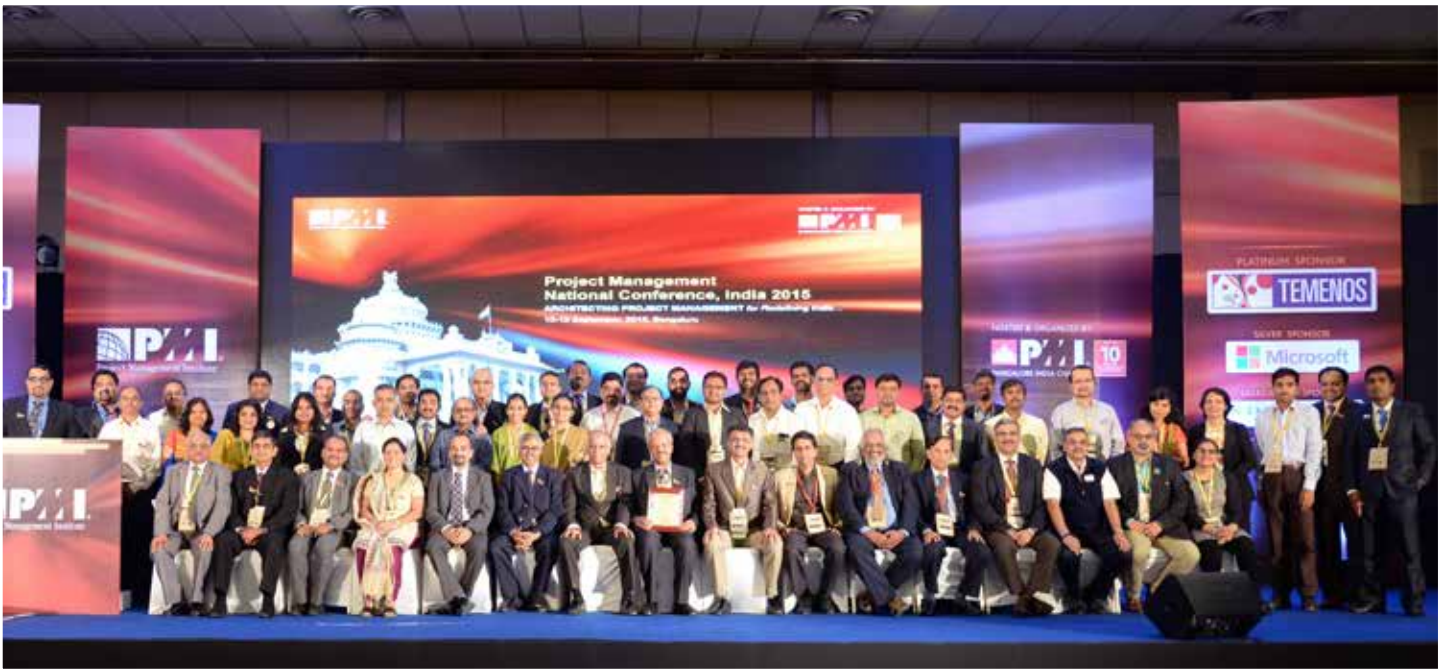
The board members and volunteers of PMI Bangalore India chapter