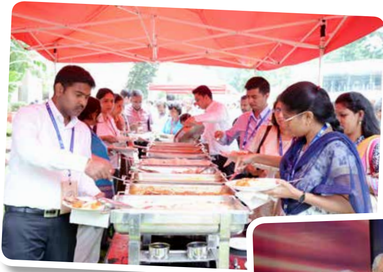
◀ Sumptuous meals were served across several counters in the sprawling lawns of the Lalit Ashok