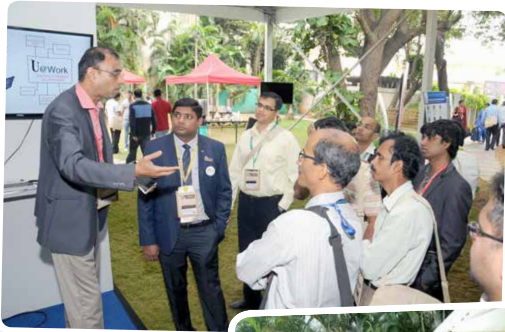
◀ Delegates attend a PM Poster session during a refreshment break