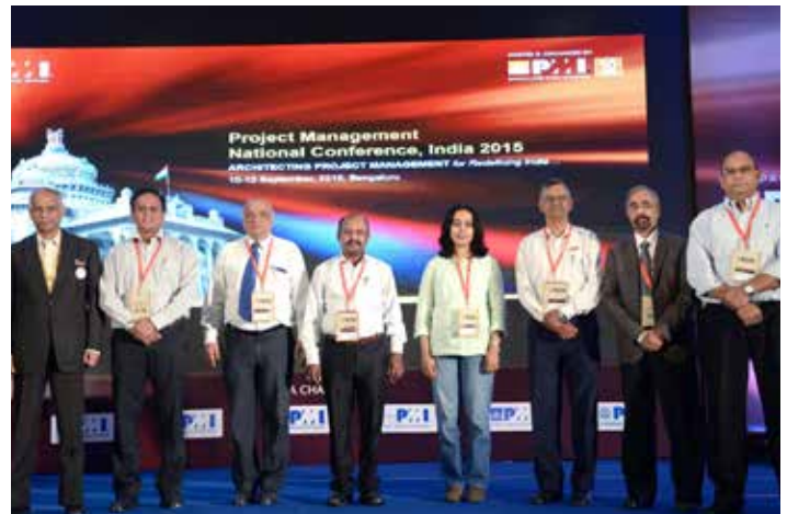
The team of chapter volunteers who managed PM Enlight, the newly introduced mentoring sessions

The Best Project of the Year in large, medium, and small categories were awarded to O.P. Jindal Power Ltd., Indian