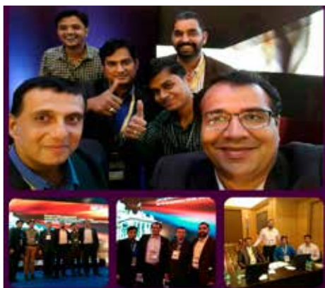
The live Webcast team members who worked meticulously to ensure that the Webcast was smooth without any technical glitches