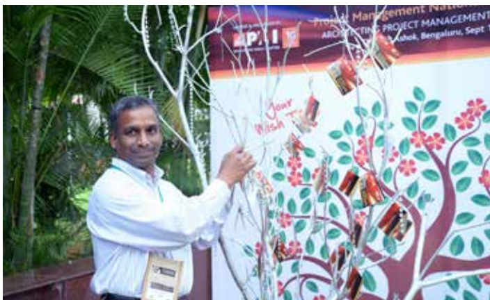
A delegate pinning his suggestion for the 2016 conference theme on the "Wish Tree"

The conference this year introduced new features such as the conference live Webcast, poster presentations during refreshment breaks, mentoring sessions, and a "Wish Tree" in which delegates could suggest themes for the next conference in Mumbai.