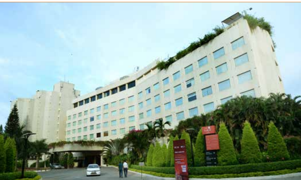
The venue for the three-day Project Management National Conference this year was the Lalit Ashok, Bengaluru