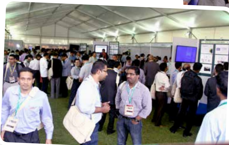
◀ Sponsors' stalls receive a steady flow of delegates during session breaks