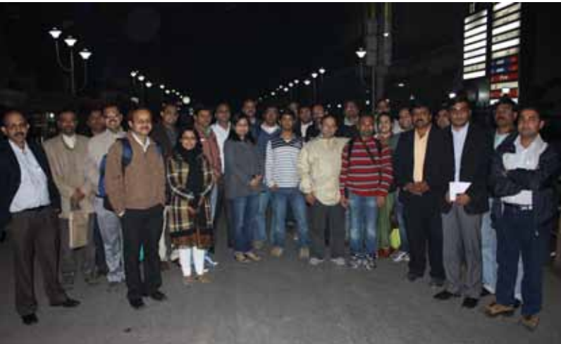
Chapter members at the Learn & Earn event.

The participants took the discussion much beyond the stated time and continued it to the roadside teashop. They reinvented the “adda” (the term used to describe small-talk at street corners) with some professional gyan and made it “Networking Adda.”