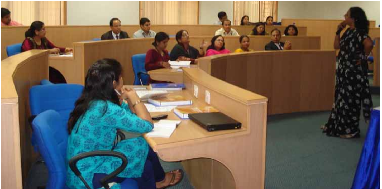
The Amity University faculty training program underway.

The chapter board has launched two programs – Company Connect and Region Connect– to promote PMI’s best project management practices among the various stakeholders and provide additional volunteering opportunities for our chapter members.