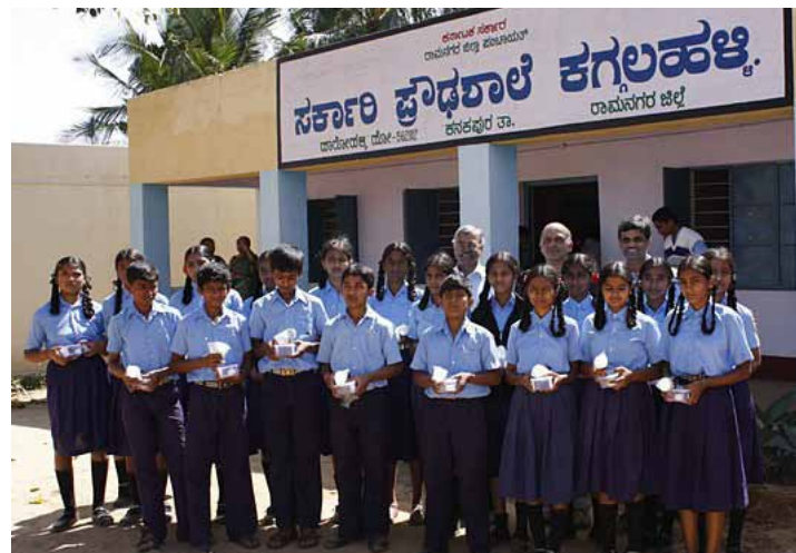
Students of Government High School, Kaggalahalli with the LED lamps.