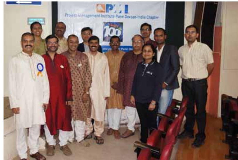
Board members and chapter members at the 100th monthly seminar.

The chapter is now looking forward to its annual conference, OnTarget, to be held in February. The theme for the conference is “Sustainable growth through effective project