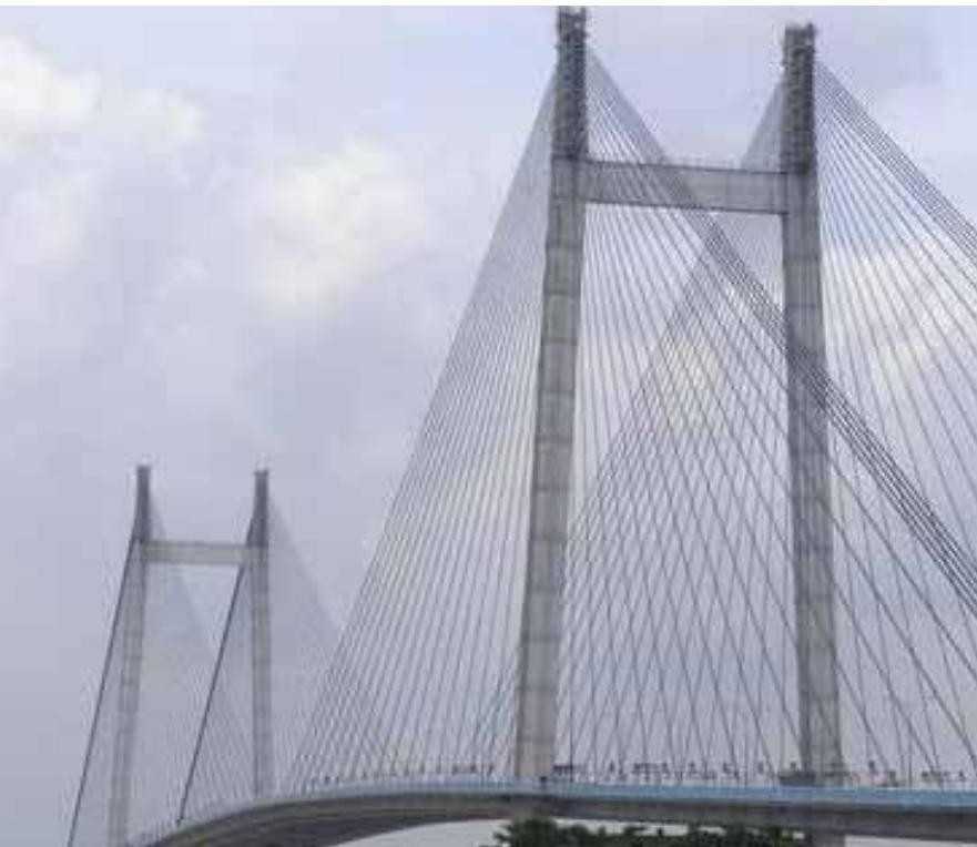
The Vidyasagar Setu is the second bridge to be built on the Hooghly River in West Bengal. The cable bridge that connects Kolkata to Hooghly was inaugurated in 1992 and is one of the first Public-Private Partnerships (PPP) projects in India.

A collaborative effort from the government, corporates, professional bodies, and the academia to document and publicize the benefits of adopting project management will go a long way in breaking perceptions and creating a positive attitude toward it. It has been the consistent effort of PMI India to engage these various players to build constructive dialogues, share knowledge, and adopt best practices from one another. A strong India rests on a strong project management foundation.