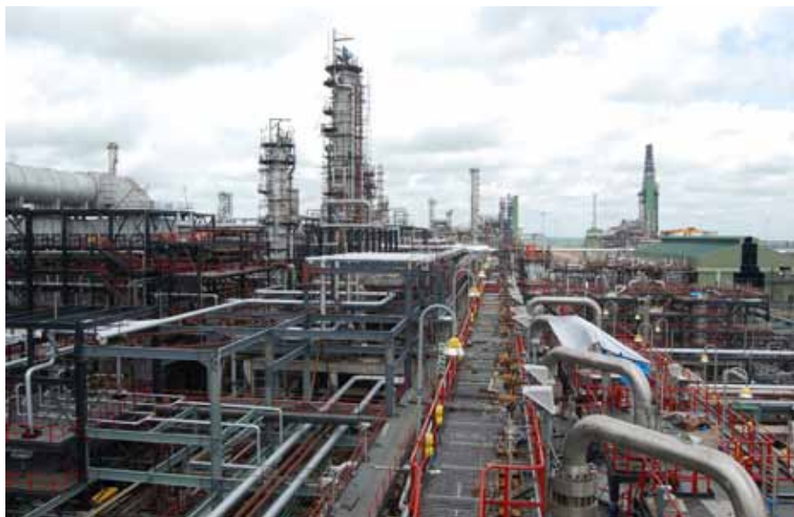
The Bina Refinery project by Engineers India Limited received the PMI India Best Project of the Year Award in 2010.

The factors that have so far held back greater adoption of project management are the "lack of client-led demand in India" and the perceived "lack of clarity of benefits". But slowly change is taking place even in the public sector. The report said, "Increasingly, even public sector companies have started laying emphasis on training programs and strengthening their existing project management units and professionals." The study estimates the market for training and certification of project managers to grow from 800 million in