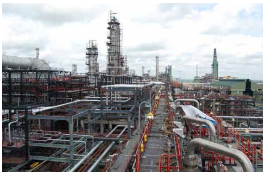
The Bina Refinery project by Engineers India Limited received the PMI India Best Project of the Year Award in 2010.

The factors that have so far held back greater adoption of project management are the "lack of client-led demand in India" and the perceived "lack of clarity of benefits". But slowly change is taking place even in the public sector. The report said, "Increasingly, even public sector companies have started laying emphasis on training programs and strengthening their existing project management units and professionals." The study estimates the market for training and certification of project managers to grow from 800 million in