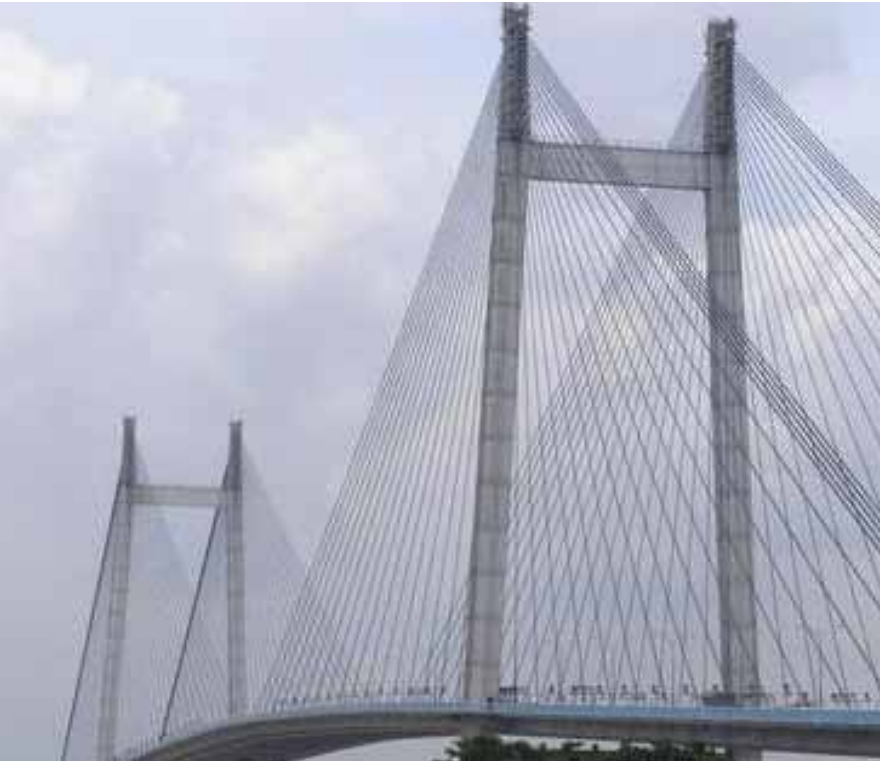
The Vidyasagar Setu is the second bridge to be built on the Hooghly River in West Bengal. The cable bridge that connects Kolkata to Hooghly was inaugurated in 1992 and is one of the first Public-Private Partnerships (PPP) projects in India.

A collaborative effort from the government, corporates, professional bodies, and the academia to document and publicize the benefits of adopting project management will go a long way in breaking perceptions and creating a positive attitude toward it. It has been the consistent effort of PMI India to engage these various players to build constructive dialogues, share knowledge, and adopt best practices from one another. A strong India rests on a strong project management foundation.