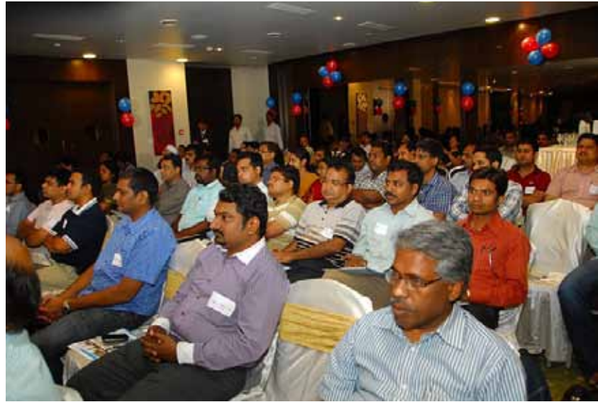
Chapter members at the annual general meeting in Hyderabad.

On 19 August, the chapter conducted a member networking meeting, in which around 115 people attended. The event